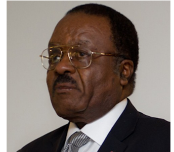
WILLIAM V.S. BULL

Liberian Ambassador to the United States