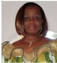
Honorable Ciata Bishop

Minister of Commerce & Industry , Republic of Liberia