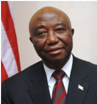
H. E. Joseph Nyuma Boakai